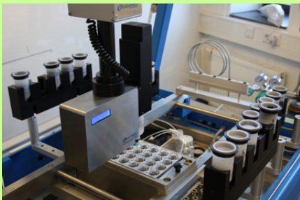
Figure 2 – Chemspeed Formax at VLCI, Amsterdam

Specialised high throughput equipment, such as the Chemspeed Formax, can be utilised to greatly increase processing power. Robotic determination of Cc values can be carried out 4 times faster than by traditional long-hand phase scans, significantly decreasing the required man power and greatly improving accuracy. This is the first time high throughput screening and HLD-NAC have been brought together.