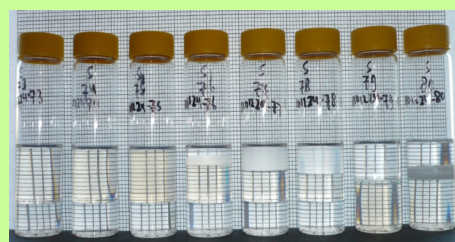
Figure 1 — Transition from w/o (type II) microemulsions on the left to o/w (type I) microemulsions on the right allows determination of a surfactant’s Cc value. The transition (type III) can be seen in the 5 th tube from the left. Phase volumes provide extra information, covered by the NAC part of HLD-NAC theory.

Measuring Cc is not very difficult. Take, for example, 8 tubes containing measured amounts of water, surfactant, salt and 8 different oils spanning the appropriate HLD range. Phase transition from w/o to o/w via a type III bi-continuous oil and water emulsion determines the optimal point from which a Cc value can be calculated (see Figure 1).