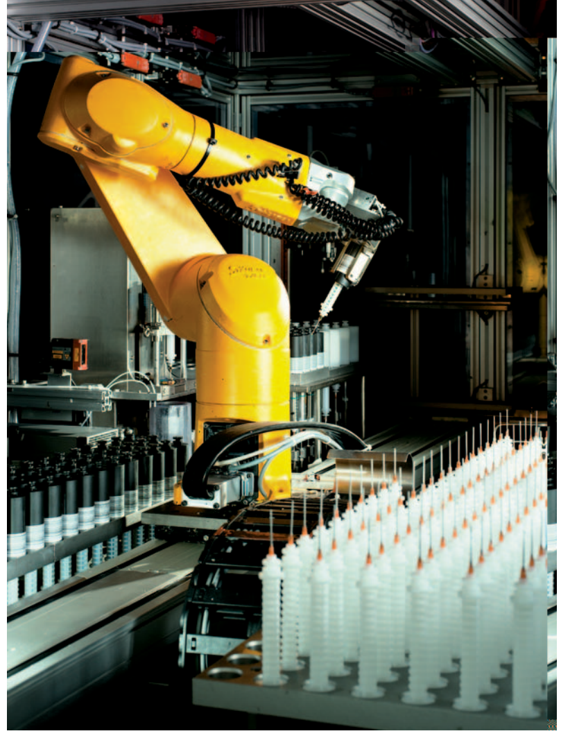
Paint maker Wörwag has been operating a fully automated high-throughput plant in its combinatorial laboratory since 2006

The plant in Stuttgart can only simulate pneumatic application. It is not designed to replicate the electrostatic application techniques commonly employed by customers in the automotive industry. "It's not possible to do a one-off pass on a sample whose different paint layers have different drying temperatures. Nor can the plant adjust or measure rheology. Yet, over time, work-arounds for these limitations are eventually found. Overall, the plant has proved very enriching for our development work," says Hörner in conclusion. Ansorge shares the view that the benefits predominate: "High-throughput screening is making inroads in the paint industry and it's on an upward trajectory. The progress of HTS is being followed with interest. All it takes is for two or three other companies to follow suit and others will climb aboard. because no-one wants to be left behind in the competition stakes." But there may be another reason for the